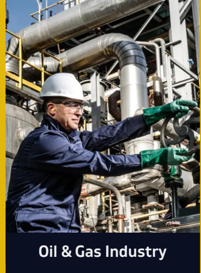
Oil & Gas Industry